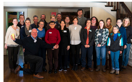
CMC members at a Data Interpretation workshop in January 2018.